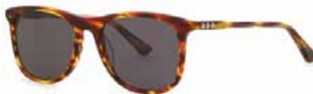
Raleigh Wayfarer-Style Sunglasses - £170 Taylor Morris Eyewear