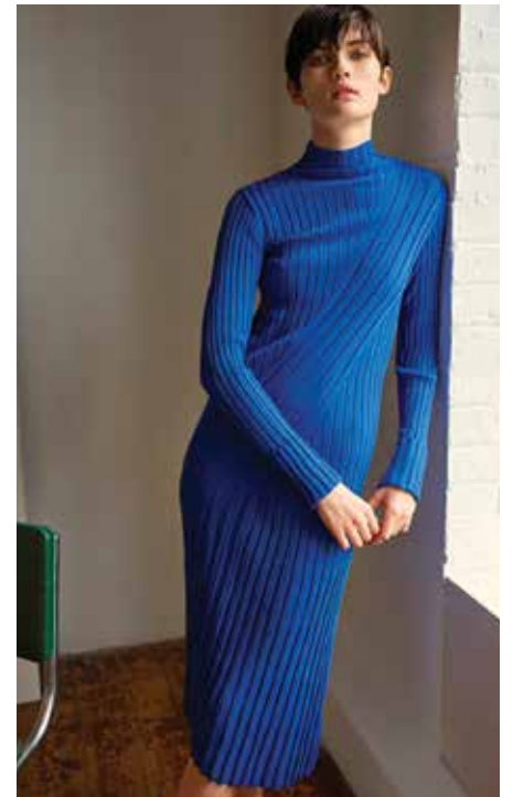
The Boutique Collection

(Left to right, top row) Reconstructed Shirt - £65, Silk Hanky Hem Printed Dress - £170 (Bottom row) Cotton Corset Dress - £90, Twisted Cut Out Dress - £160, Directional Ribbed Dress - £70