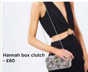
Hannah box clutch - £80