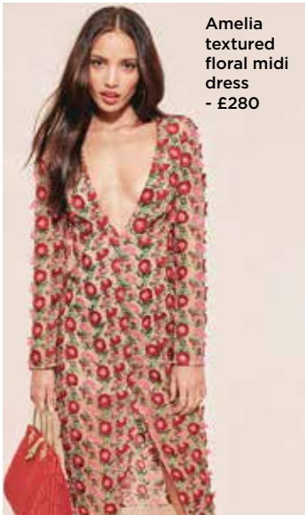
Amelia textured floral midi dress - £280

WE'VE CAUGHT UP WITH LOVE MY APPAREL'S RHIAN JONES TO DELVE DEEPER INTO THE FASHION WORLD AND FIND OUT WHAT TO EXPECT TO SEE THIS SUMMER