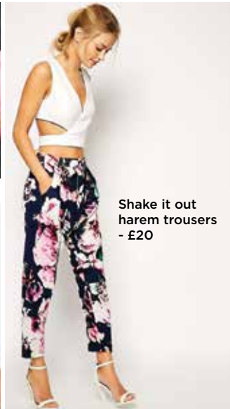
Shake it out harem trousers - £20