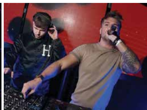
MADE IN LEEDS FESTIVAL

SUMMER IN THE CITY • MUST HAVE FASHION • LIVE MUSIC EVENTS • MUST VISIT VENUES