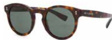
Tortoiseshell Round-Frame Sunglasses - £158 Valentino

Each of these are available at Harvey Nichols Leeds.