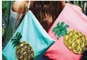
Pineapple Sequin Clutch Bag - £45