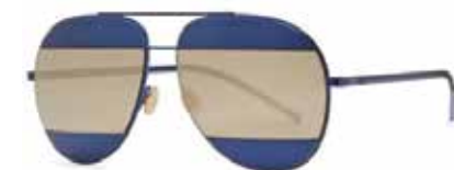
Dior Split Blue Aviator-Style Sunglasses - £380 Christian Dior