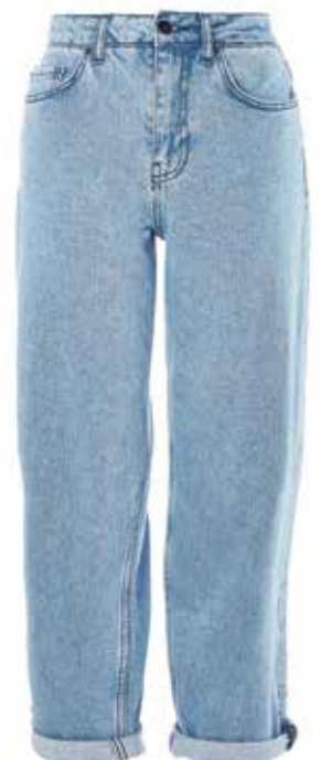
Boy Jeans - £55

My love for dressing people and making them feel the best version of themselves is very rewarding.