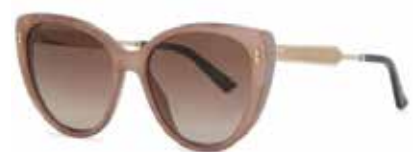
Rose Marble-Effect Cat-Eye Sunglasses - £240 Gucci

Each of these are available at Harvey Nichols Leeds.