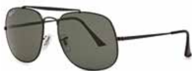
Black Aviator-Style Sunglasses - £180 Ray-Ban