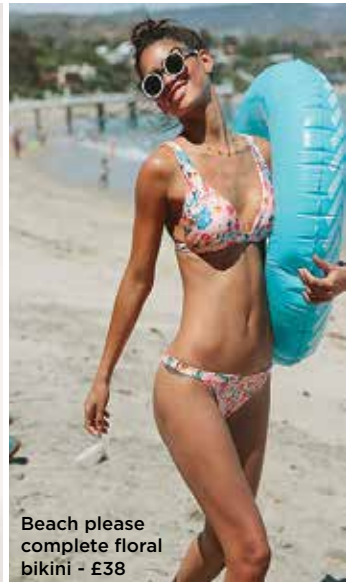
Beach please complete floral bikini - £38