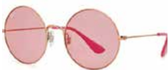
Pink Round-Frame Sunglasses - £135 Ray-Ban